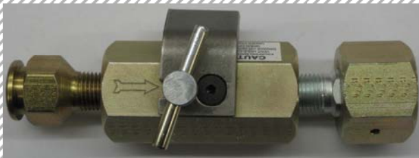
LUBE ADAPTERS WITH SAFETY VENT BODY (WKM #2 & CIW #2) INSTEAD OF WKM #1 AND CIW #1