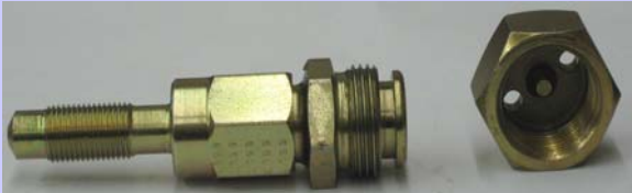
PACKING INJECTOR LUBRICATION ADAPTER (PI-ADAPTER)